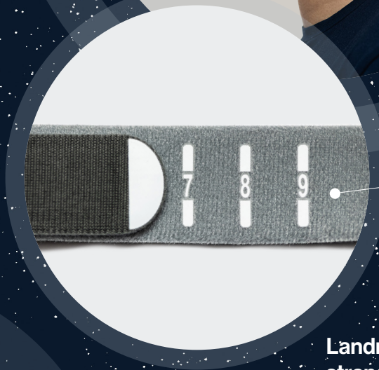
Landmarks on the lower straps

Quick Adjust feature with landmarks Easy to handle and set Soft & seamless fabric Two-tone